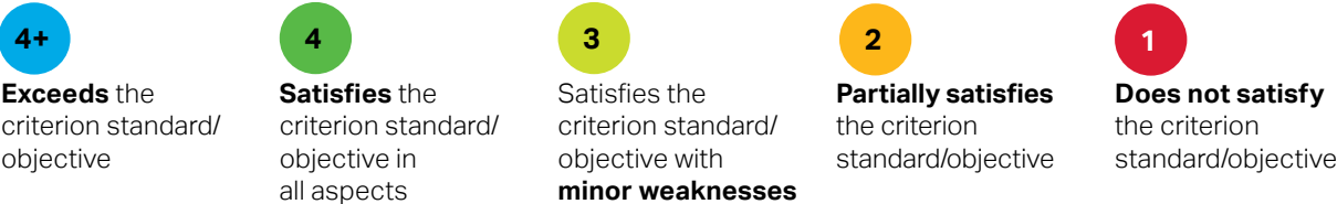
Figure 3: Rating scale

We use a five-point rating scale with statements about the degree to which a proposal meets each criterion standard or competition objective.