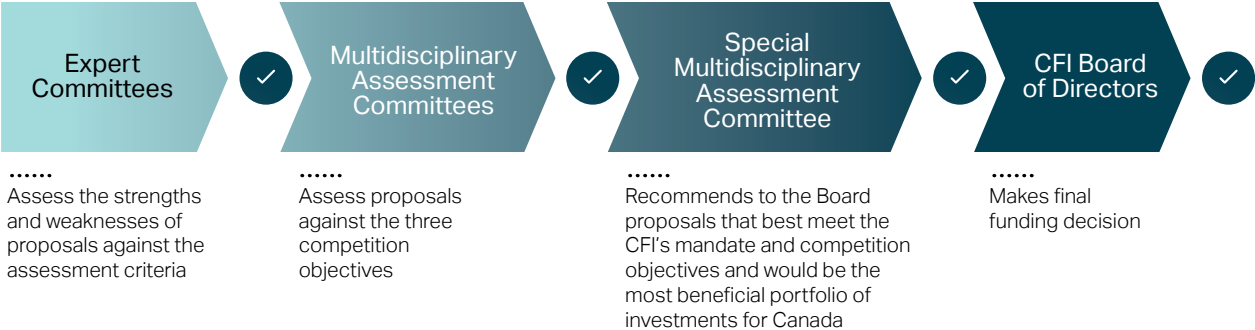
Figure 2: Review process

Proposals will be evaluated in a three-step review process, with final funding decisions made by the CFI’s Board of Directors.